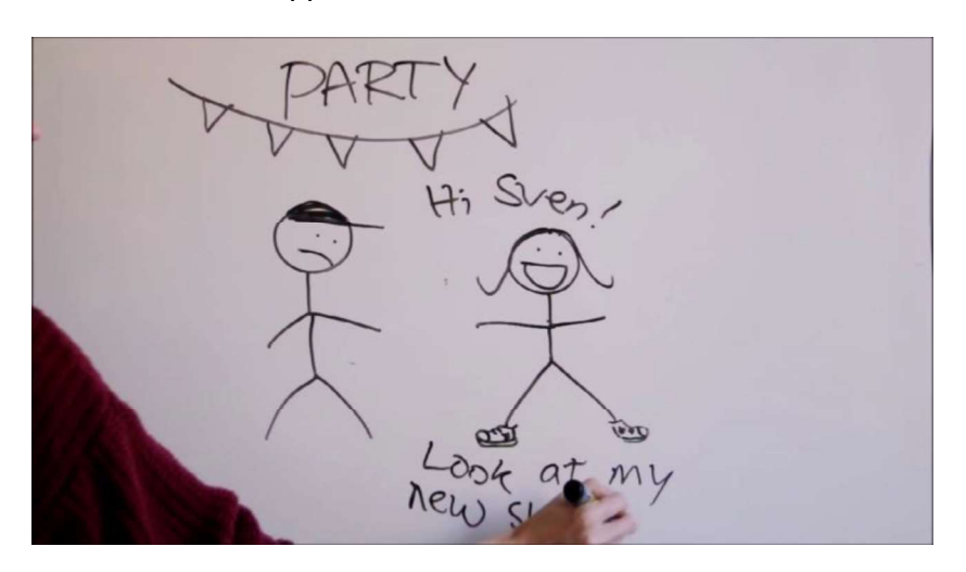
Figure 2. A short video was created by the engineering students to describe the idea and concept of their application for the marketing students.

Analyzing the evaluations by the students on the two courses revealed that they liked the general concept with the collaboration around the project. However, they felt that the setup of the collaboration lacked structure and students on both courses from time to time struggled with the unknowns, as they felt somewhat dependent on students on the opposite side of the planet. However, analyzing the conversations and use of the online communication platform (Slack), it could be noted that the students exhibited skills in finding solutions and workarounds to complete their assessments when they experienced obstacles. The results of the collaboration and discussions among the teachers on the two courses concluded in several lessons learned, from a teacher's perspective, from the first collaboration: